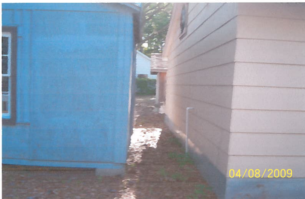
36196 REAR GARAGE VIEW