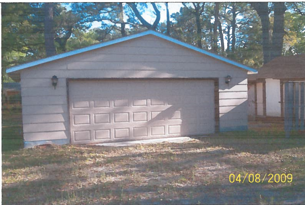
36196 FRONT GARAGE VIEW

If using the Elevation Certificate to obtain NFIP flood insurance, affix at least two building photographs below according to the instructions for Item A6. Identify all photographs with: date taken; "Front View" and "Rear View"; and, if required, "Right Side View" and "Left Side View." If submitting more photographs than will fit on this page, use the Continuation Page, following.