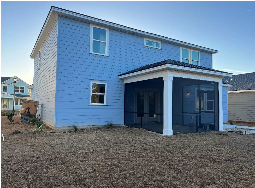
REAR RIGHT VIEW 01/20/2023