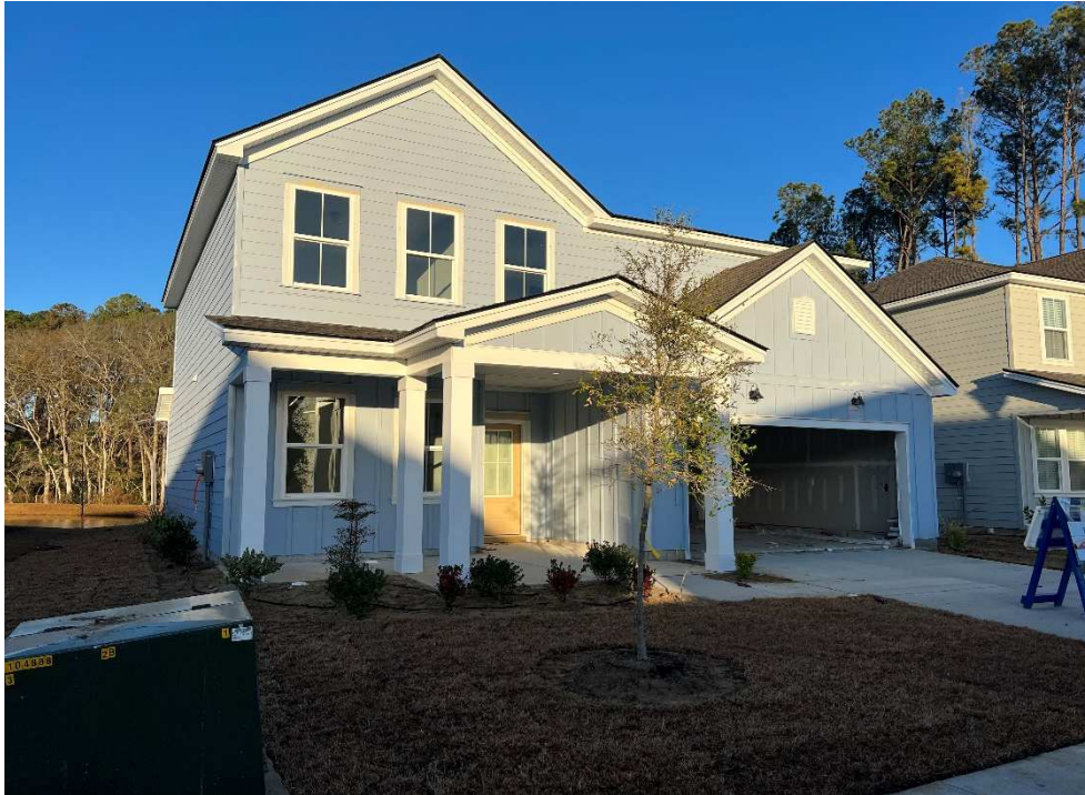
FRONT LEFT VIEW 01/20/2023

If using the Elevation Certificate to obtain NFIP flood insurance, affix at least 2 building photographs below according to the instructions for Item A6. Identify all photographs with date taken; "Front View" and "Rear View"; and, if required, "Right Side View" and "Left Side View." When applicable, photographs must show the foundation with representative examples of the flood openings or vents, as indicated in Section A8. If submitting more photographs than will fit on this page, use the Continuation Page.