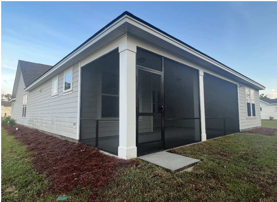
REAR RIGHT VIEW 03/06/2023