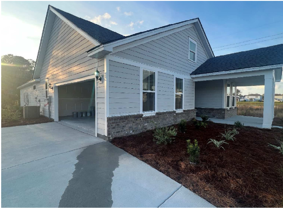
FRONT LEFT VIEW 03/06/2023

If using the Elevation Certificate to obtain NFIP flood insurance, affix at least 2 building photographs below according to the instructions for Item A6. Identify all photographs with date taken; "Front View" and "Rear View"; and, if required, "Right Side View" and "Left Side View." When applicable, photographs must show the foundation with representative examples of the flood openings or vents, as indicated in Section A8. If submitting more photographs than will fit on this page, use the Continuation Page.